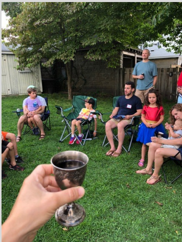
We held our second annual Shabbat BBQ to kick off the new Shalom School year.

then attend services starting at 6 PM. During class, we will hand out gifts to our new students! We request that families help pay for dinner so we don't need to worry about the logistics of a potluck. Students and parents are expected to attend.