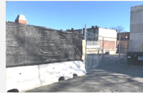
In the photos: What will most likely not be the location of Melrose's licensed pot shop.