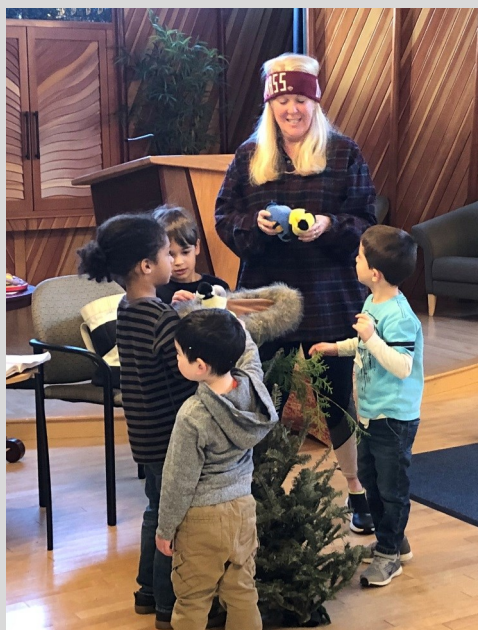
(Continued on page 8)